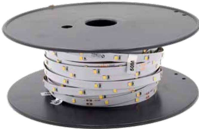
Supplied in 50m rolls

DALI DIMMABLE DRIVERS: HD-0025-24V (SAP 2000828) HD-0050-24V (SAP 2000829) HD-0200-24V (SAP 2000830)