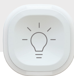
(Edgy Series/Clipsal 30)