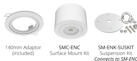
140mm Adaptor (included)