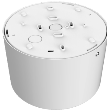
Front view when installing with a Haneco LUME3WD63

Suits: LUME, VIVA110 & DETAIL series, DULAR Tritone Adjustable, etc.