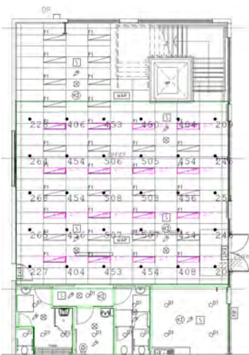
Office layout sample #1 : utilizing 36 watt panel (1200 x 300) maintained A_v = 387 lux, M_f = 0.8 , Uniformity = 0.54